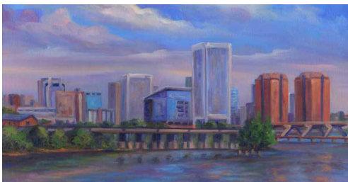
Richmond Skyline