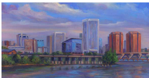
Richmond Skyline