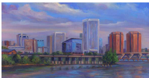
Richmond Skyline