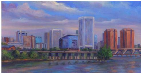
Richmond Skyline